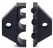
Spare die for CRIMPFOX-RC 25

Replacement die - CRIMPFOX-RC 25/DIE - 1212299