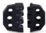
Spare die for CRIMPFOX-SC 1,5

Replacement die - CRIMPFOX-SC 1,5/DIE - 1212049