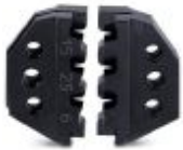
Spare die for CRIMPFOX-SC 6

Replacement die - CRIMPFOX-SC 6/DIE - 1212051