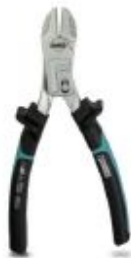
Power diagonal cutter, 200 mm, induction-hardened cutting, VDE 1000 V AC/ 1500 V DC tested

Please be informed that the data shown in this PDF Document is generated from our Online Catalog. Please find the complete data in the user's documentation. Our General Terms of Use for Downloads are valid ( http://phoenixcontact.com/download )