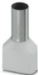
Ferrule, sleeve length: 16 mm, length: 31 mm, color: white

Please be informed that the data shown in this PDF Document is generated from our Online Catalog. Please find the complete data in the user's documentation. Our General Terms of Use for Downloads are valid ( http://phoenixcontact.com/download )