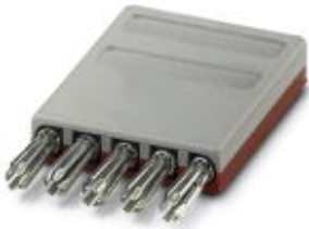
The figure shows test plugs SPB 5-MKDS 3 and SPB 5-GMKDS 3