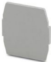
Separating plate, length: 22 mm, width: 0.5 mm, height: 22 mm, color: gray

Please be informed that the data shown in this PDF Document is generated from our Online Catalog. Please find the complete data in the user's documentation. Our General Terms of Use for Downloads are valid ( http://phoenixcontact.com/download )