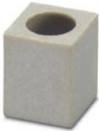
Bridge bar isolator, color: gray

Please be informed that the data shown in this PDF Document is generated from our Online Catalog. Please find the complete data in the user's documentation. Our General Terms of Use for Downloads are valid ( http://phoenixcontact.com/download )