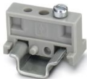
End clamp, width: 6.2 mm, color: gray

Please be informed that the data shown in this PDF Document is generated from our Online Catalog. Please find the complete data in the user's documentation. Our General Terms of Use for Downloads are valid ( http://phoenixcontact.com/download )