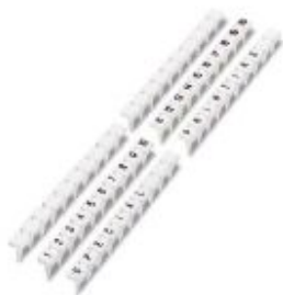
BNB Zack marker strip, 10-section, divisible, horizontally labeled with the consecutive numbers: 1 ... 10, white

Please be informed that the data shown in this PDF Document is generated from our Online Catalog. Please find the complete data in the user's documentation. Our General Terms of Use for Downloads are valid ( http://phoenixcontact.com/download )