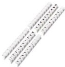
BNB Zack marker strip, 10-section, divisible, horizontally labeled with the consecutive numbers: 31 ... 40, white

Please be informed that the data shown in this PDF Document is generated from our Online Catalog. Please find the complete data in the user's documentation. Our General Terms of Use for Downloads are valid ( http://phoenixcontact.com/download )