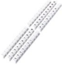
BNB Zack marker strip, 10-section, divisible, horizontally labeled with the consecutive numbers: 1 ... 10, white

Please be informed that the data shown in this PDF Document is generated from our Online Catalog. Please find the complete data in the user's documentation. Our General Terms of Use for Downloads are valid ( http://phoenixcontact.com/download )