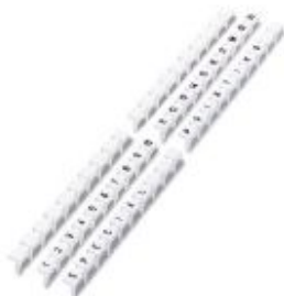
BNB Zack marker strip, 10-section, divisible, horizontally labeled with the consecutive numbers: 21 ... 30, white

Please be informed that the data shown in this PDF Document is generated from our Online Catalog. Please find the complete data in the user's documentation. Our General Terms of Use for Downloads are valid ( http://phoenixcontact.com/download )