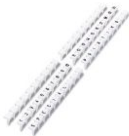
BNB Zack marker strip, 10-section, divisible, horizontally labeled with the consecutive numbers: 31 ... 40, white

Please be informed that the data shown in this PDF Document is generated from our Online Catalog. Please find the complete data in the user's documentation. Our General Terms of Use for Downloads are valid ( http://phoenixcontact.com/download )