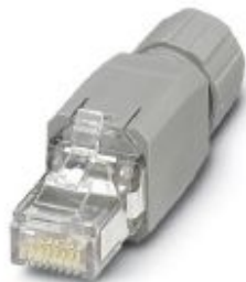
RJ45 connector, IP20, CAT5e, 4-pos., VARAN with QUICKON fast connection technology, for 1-wire and 7-wire conductors AWG 26 ... 23, for cable diameter 4.5 mm ... 8.0 mm, color: gray

Please be informed that the data shown in this PDF Document is generated from our Online Catalog. Please find the complete data in the user's documentation. Our General Terms of Use for Downloads are valid ( http://phoenixcontact.com/download )