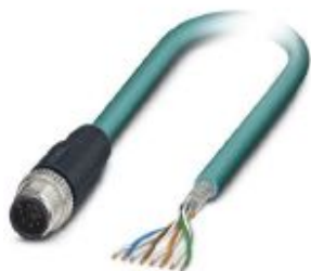
Assembled Ethernet cable, shielded, 4-pair, AWG 26 stranded (7-wire), RAL 5021 (sea blue), M12 plug to free cable end, line, length 2 m

Please be informed that the data shown in this PDF Document is generated from our Online Catalog. Please find the complete data in the user's documentation. Our General Terms of Use for Downloads are valid ( http://phoenixcontact.com/download )