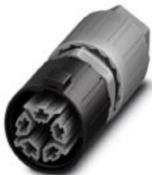
QUICKON connector, gray, 4+PE-pos., 1.0 mm 2 ... 2.5 mm 2 /690 V/20 A, with QUICKON nut, for cables with a diameter of 9 mm ... 16 mm.

Please be informed that the data shown in this PDF Document is generated from our Online Catalog. Please find the complete data in the user's documentation. Our General Terms of Use for Downloads are valid ( http://phoenixcontact.com/download )