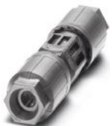
QUICKON cable connector, gray, 4+PE-pos., 1.0 mm 2 ... 2.5 mm 2 / 690 V / 20 A, for 6 mm ... 11 mm cable diameter.

Please be informed that the data shown in this PDF Document is generated from our Online Catalog. Please find the complete data in the user's documentation. Our General Terms of Use for Downloads are valid ( http://phoenixcontact.com/download )