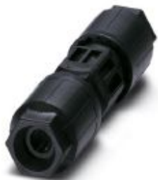
QUICKON cable connector, black, 4+PE-pos., 1.0 mm 2 ... 2.5 mm 2 / 690 V / 20 A, for 9 mm ... 16 mm cable diameter.

Please be informed that the data shown in this PDF Document is generated from our Online Catalog. Please find the complete data in the user's documentation. Our General Terms of Use for Downloads are valid ( http://phoenixcontact.com/download )