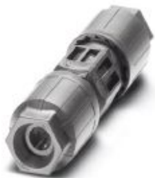
QUICKON cable connector, gray, 4+PE-pos., 1.0 mm 2 ... 2.5 mm 2 / 690 V / 20 A, for 6 mm ... 11 mm cable diameter.

Please be informed that the data shown in this PDF Document is generated from our Online Catalog. Please find the complete data in the user's documentation. Our General Terms of Use for Downloads are valid ( http://phoenixcontact.com/download )