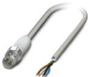
Sensor/actuator cable, 4-position, PP-EPDM halogen-free, gray RAL 7035, Plug straight M12, coding: A, on free cable end, cable length: 10 m, Hygienic design, with high-grade steel knurl

Please be informed that the data shown in this PDF Document is generated from our Online Catalog. Please find the complete data in the user's documentation. Our General Terms of Use for Downloads are valid ( http://phoenixcontact.com/download )