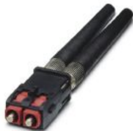
Fiber optic connector SC-RJ, IP20, duplex, with fast connection technology, for PROFINET, for PCF fiber 200/230 μm, for individual wire diameter 2.2 mm

Please be informed that the data shown in this PDF Document is generated from our Online Catalog. Please find the complete data in the user's documentation. Our General Terms of Use for Downloads are valid ( http://phoenixcontact.com/download )