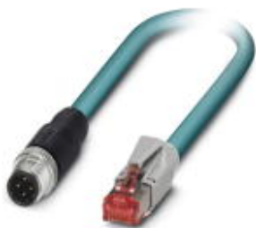
Assembled Ethernet cable, CAT5e, shielded, 2-pair, 26 AWG stranded (7-wire), RAL 5021 (water blue), M12 plug, A-coded to RJ45 plug/IP20, line, length: 3 m

Please be informed that the data shown in this PDF Document is generated from our Online Catalog. Please find the complete data in the user's documentation. Our General Terms of Use for Downloads are valid ( http://phoenixcontact.com/download )