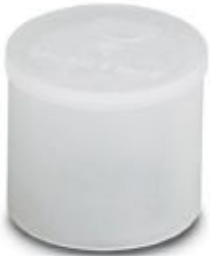
Protective cap, transparent plastic, for 5 x 2.5 mm 2 QPD connector, IP50.

Please be informed that the data shown in this PDF Document is generated from our Online Catalog. Please find the complete data in the user's documentation. Our General Terms of Use for Downloads are valid ( http://phoenixcontact.com/download )