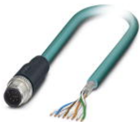
Assembled Ethernet cable, shielded, 4-pair, 26 AWG stranded (7-wire), RAL 5021 (water blue), M12 male plug to free cable end, line, length: 4 m

Please be informed that the data shown in this PDF Document is generated from our Online Catalog. Please find the complete data in the user's documentation. Our General Terms of Use for Downloads are valid ( http://phoenixcontact.com/download )