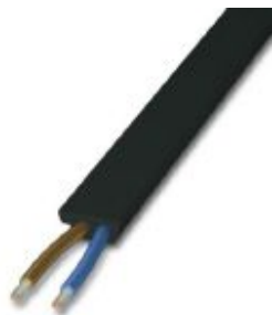
AS-Interface TPE flat conductor with UL in black, for additional power supply, 2 x 1.5 mm 2 , 100 m ring

Please be informed that the data shown in this PDF Document is generated from our Online Catalog. Please find the complete data in the user's documentation. Our General Terms of Use for Downloads are valid ( http://phoenixcontact.com/download )