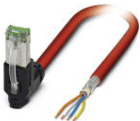
Sercos III patch cable, shielded, star quad, 22 AWG stranded (7-wire), RAL 3020 (traffic red), RJ45 plug/IP20 (angled) to open cable end (angled), length: 3 m

Please be informed that the data shown in this PDF Document is generated from our Online Catalog. Please find the complete data in the user's documentation. Our General Terms of Use for Downloads are valid ( http://phoenixcontact.com/download )