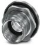
Housing screw connection, Socket, M12-Push-Pull, Rear mounting, M16, THR- und Wellenlötkontakte

Housing screw connection - SACC-BP-F-M12-THR PP - 1027662