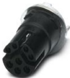
Hybrid flush-type socket, Ethernet, 8-pos., M12 SPEEDCON, with straight solder connection

Please be informed that the data shown in this PDF Document is generated from our Online Catalog. Please find the complete data in the user's documentation. Our General Terms of Use for Downloads are valid ( http://phoenixcontact.com/download )