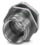
Housing screw connection, Socket, M12-Push-Pull, Front mounting, M14 x 1, THR- und Wellenlötkontakte

Housing screw connection - SACC-FP-F-M12-THR PP - 1027678