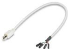
USB cable, with USB connectors at one end, assembled connector type: B, single post connector, length: 0.3 m

Please be informed that the data shown in this PDF Document is generated from our Online Catalog. Please find the complete data in the user's documentation. Our General Terms of Use for Downloads are valid ( http://phoenixcontact.com/download )