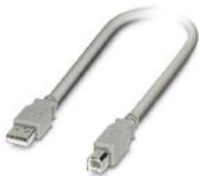
USB cable, with USB connectors at both ends, assembled connector type: A on B, length:1.8 m

Please be informed that the data shown in this PDF Document is generated from our Online Catalog. Please find the complete data in the user's documentation. Our General Terms of Use for Downloads are valid ( http://phoenixcontact.com/download )