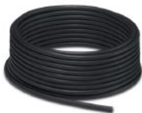
Cable reel, 12-position, PUR/PVC, black RAL 9005, shielded, free cable end, on free cable end, cable length: 100 m, Twisted pair cable

Please be informed that the data shown in this PDF Document is generated from our Online Catalog. Please find the complete data in the user's documentation. Our General Terms of Use for Downloads are valid ( http://phoenixcontact.com/download )