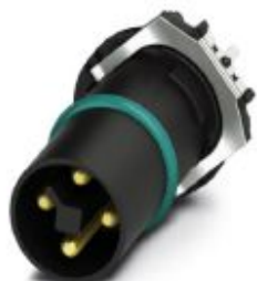
Flush-type connector, Power, 4-position, Plug, straight, M12, T power, PCB mounting, THR solder connection

Please be informed that the data shown in this PDF Document is generated from our Online Catalog. Please find the complete data in the user's documentation. Our General Terms of Use for Downloads are valid ( http://phoenixcontact.com/download )