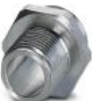
M12 pin, front mounting THR with M14 screw fastening

Housing screw connection - SACC-DSIV-M12-PLUG-9 THR - 1417984