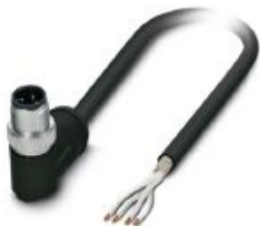
Sensor/actuator cable, 4-position, PE-X halogen-free, black, shielded, Plug angled M12 SPEEDCON, coding: A, on free cable end, cable length: 5 m, For railway applications

Please be informed that the data shown in this PDF Document is generated from our Online Catalog. Please find the complete data in the user's documentation. Our General Terms of Use for Downloads are valid ( http://phoenixcontact.com/download )