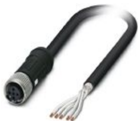
Sensor/actuator cable, 5-position, PE-X halogen-free, black, shielded, free cable end, on Socket straight M12 SPEEDCON, coding: A, cable length: 2 m, For railway applications

Please be informed that the data shown in this PDF Document is generated from our Online Catalog. Please find the complete data in the user's documentation. Our General Terms of Use for Downloads are valid ( http://phoenixcontact.com/download )