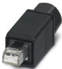
RJ45 connector, IP65/IP67, with push/pull interlocking (version 4), plastic housing, for 10 Gbps, for 24 ... 28 AWG stranded conductors

Please be informed that the data shown in this PDF Document is generated from our Online Catalog. Please find the complete data in the user's documentation. Our General Terms of Use for Downloads are valid ( http://phoenixcontact.com/download )