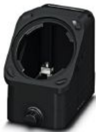
HEAVYCON EVO sleeve housing, plastic, with bayonet flange for EVO screw connection, B10, for single locking latch, height: 60.5 mm, without EVO screw connection

Please be informed that the data shown in this PDF Document is generated from our Online Catalog. Please find the complete data in the user's documentation. Our General Terms of Use for Downloads are valid ( http://phoenixcontact.com/download )