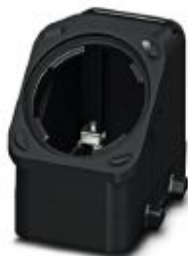
HEAVYCON EVO sleeve housing, plastic, with bayonet flange for EVO screw connection, B10, for double locking latch, height: 60.5 mm, without EVO screw connection

Please be informed that the data shown in this PDF Document is generated from our Online Catalog. Please find the complete data in the user's documentation. Our General Terms of Use for Downloads are valid ( http://phoenixcontact.com/download )