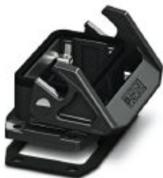
HEAVYCON EVO panel mounting base, plastic, B10, with single locking latch, height: 30.5 mm, with flat gasket

Please be informed that the data shown in this PDF Document is generated from our Online Catalog. Please find the complete data in the user's documentation. Our General Terms of Use for Downloads are valid ( http://phoenixcontact.com/download )