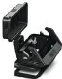
HEAVYCON EVO panel mounting base, plastic, B16, with single locking latch, height: 30.5 mm, with flat gasket, with protective cover

Please be informed that the data shown in this PDF Document is generated from our Online Catalog. Please find the complete data in the user's documentation. Our General Terms of Use for Downloads are valid ( http://phoenixcontact.com/download )