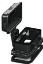
HEAVYCON EVO panel mounting base, plastic, B16, for double locking latch, height: 30.5 mm, with flat gasket, with protective cover

Please be informed that the data shown in this PDF Document is generated from our Online Catalog. Please find the complete data in the user's documentation. Our General Terms of Use for Downloads are valid ( http://phoenixcontact.com/download )