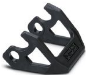
Replacement double locking latch for HEAVYCON EVO housing, HC-B10/HC-B16/HC-B24, PA

Please be informed that the data shown in this PDF Document is generated from our Online Catalog. Please find the complete data in the user's documentation. Our General Terms of Use for Downloads are valid ( http://phoenixcontact.com/download )