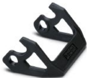
Replacement single locking latch for HEAVYCON EVO housing type B6, PA

Please be informed that the data shown in this PDF Document is generated from our Online Catalog. Please find the complete data in the user's documentation. Our General Terms of Use for Downloads are valid ( http://phoenixcontact.com/download )