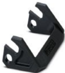
Replacement single locking latch for HEAVYCON EVO housing type B10, PA

Please be informed that the data shown in this PDF Document is generated from our Online Catalog. Please find the complete data in the user's documentation. Our General Terms of Use for Downloads are valid ( http://phoenixcontact.com/download )