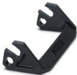
Replacement single locking latch for HEAVYCON EVO housing type B16, PA

Please be informed that the data shown in this PDF Document is generated from our Online Catalog. Please find the complete data in the user's documentation. Our General Terms of Use for Downloads are valid ( http://phoenixcontact.com/download )