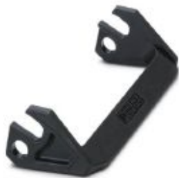
Replacement single locking latch for HEAVYCON EVO housing type B24, PA

Please be informed that the data shown in this PDF Document is generated from our Online Catalog. Please find the complete data in the user's documentation. Our General Terms of Use for Downloads are valid ( http://phoenixcontact.com/download )