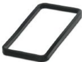
Profile gasket for HEAVYCON EVO supporting base element type B16

Please be informed that the data shown in this PDF Document is generated from our Online Catalog. Please find the complete data in the user's documentation. Our General Terms of Use for Downloads are valid ( http://phoenixcontact.com/download )