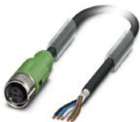
Sensor/actuator cable, 5-position, PUR halogen-free, black-gray RAL 7021, shielded, free cable end, on Socket straight M12 SPEEDCON, coding: A, cable length: 1.5 m

Please be informed that the data shown in this PDF Document is generated from our Online Catalog. Please find the complete data in the user's documentation. Our General Terms of Use for Downloads are valid ( http://phoenixcontact.com/download )