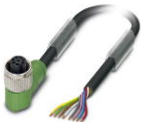
M12 socket, angled, 8-pos., with connected master cable, for sensor/actuator box with M8 slots, cable length: 5 m

Please be informed that the data shown in this PDF Document is generated from our Online Catalog. Please find the complete data in the user's documentation. Our General Terms of Use for Downloads are valid ( http://phoenixcontact.com/download )