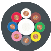
PUR halogen-free black [PUR]