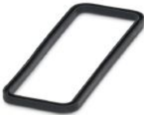
Replacement profile gasket for HC-D25 sleeve housing

Please be informed that the data shown in this PDF Document is generated from our Online Catalog. Please find the complete data in the user's documentation. Our General Terms of Use for Downloads are valid ( http://phoenixcontact.com/download )