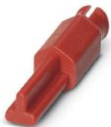
Coding profile for HC-D 7-ESTC-COD pin contact inserts

Please be informed that the data shown in this PDF Document is generated from our Online Catalog. Please find the complete data in the user's documentation. Our General Terms of Use for Downloads are valid ( http://phoenixcontact.com/download )